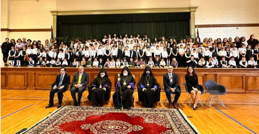
November 15, 2023 His Holiness Catholicos Aram I visits and blesses Hovnanian School and our students